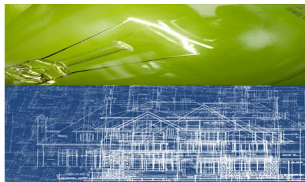
ABB ♦ Armstrong ♦ Coca Cola ♦ Herman Miller ♦ Unilever ♦ DuPont ♦ ArvinMeritor ♦ JohnsonDiversey ♦ Vattenfall ♦ Black & Decker ♦ Nike ♦ BASF ♦ Johnson & Johnson ♦ Rio Tinto ♦ Dow Corning ♦ S.C. Johnson & Son ♦ General Motors ♦ United Technologies Corporation ♦ 2006